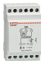
Safety transformer CTRS AC 2