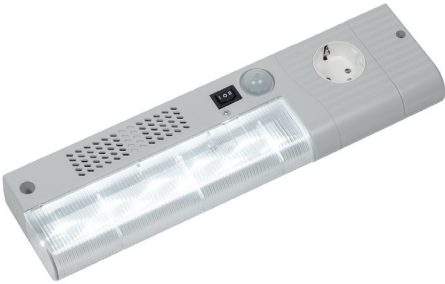
Illustration shows the Slimline light with integrated socket (Germany) Art. No. 02530.1-00